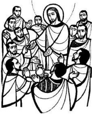
Jesus appears to the apostles